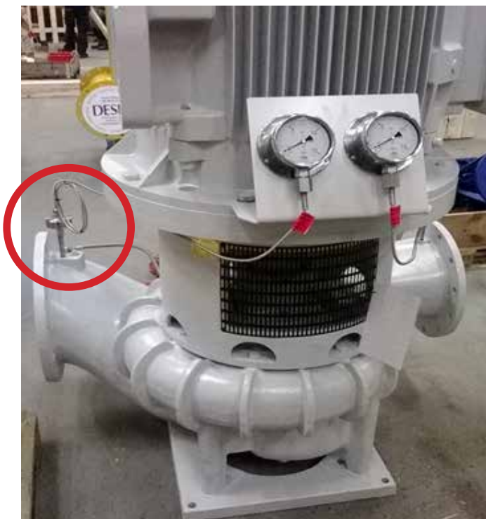
Super Duplex NSL stainless steel pump for aggressive fluids.

All pump sizes are available as self-priming pumps by means of a separate built-on air-operated ejector priming unit or built-on priming pump, and can be delivered with high-efficient motors and frequency converters for efficient performance etc.