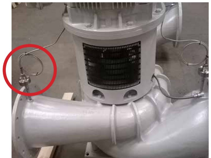
The aggressive fluid will not damage the manometers thanks to the fitted membranes.